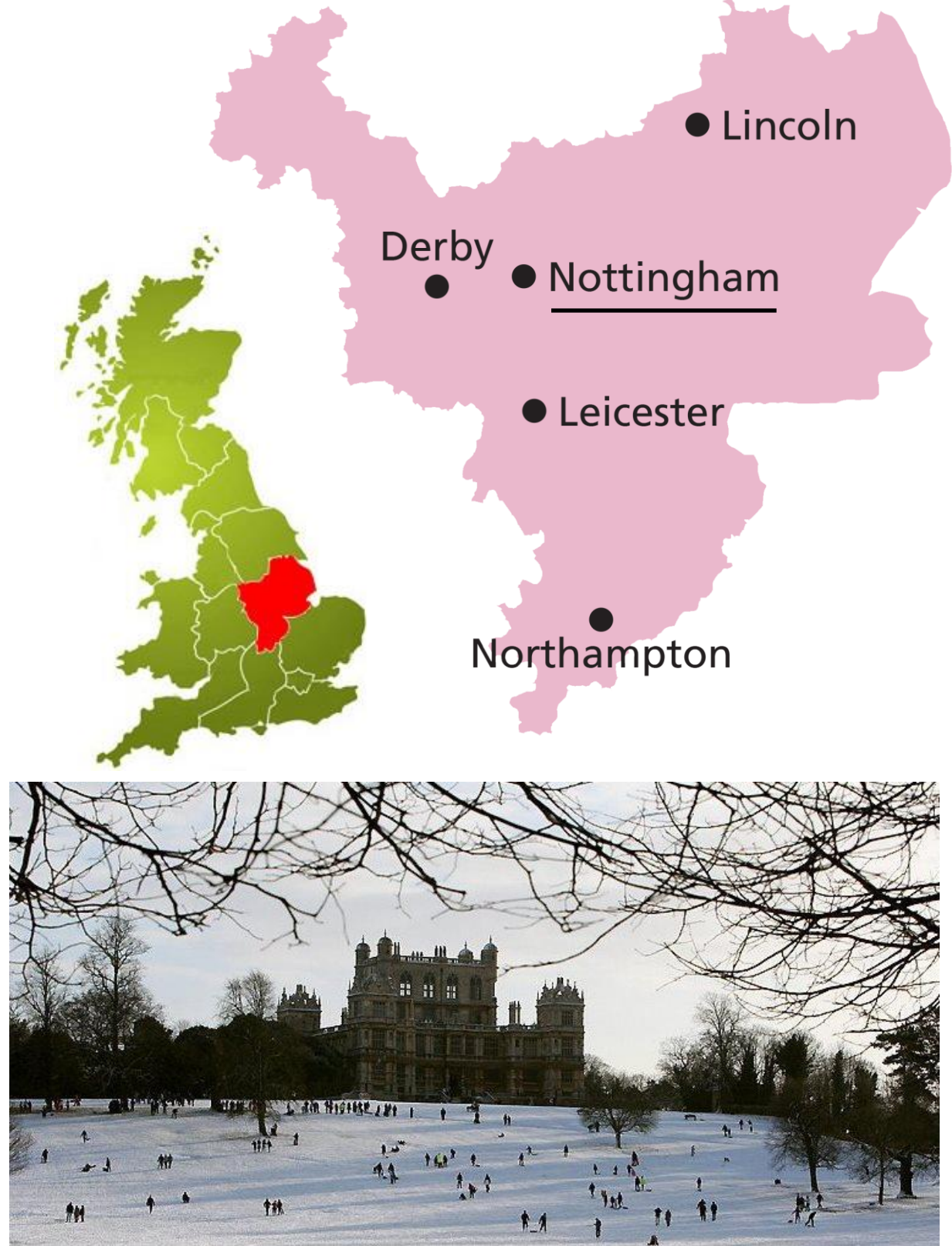
Wollaton Hall, Nottingham